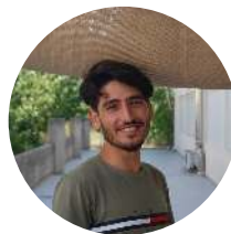
Interpreters 15 Community volunteers