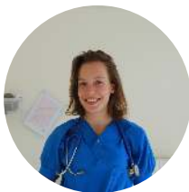
Nurses and Doctors 10-15 International volunteers